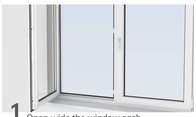
Open wide the window sash.