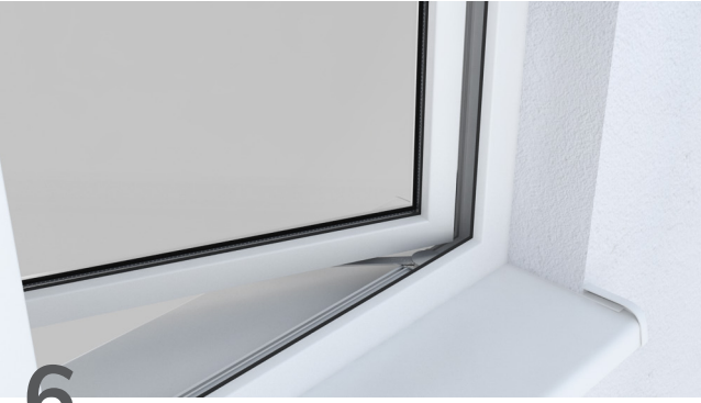
Blockade is ready to use.