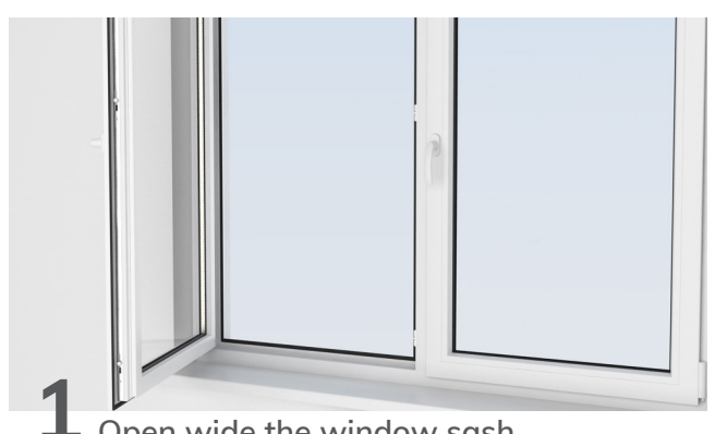
Open wide the window sash .