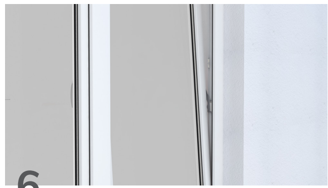
\overline{\mathbf{O}} Blockade is ready to use.