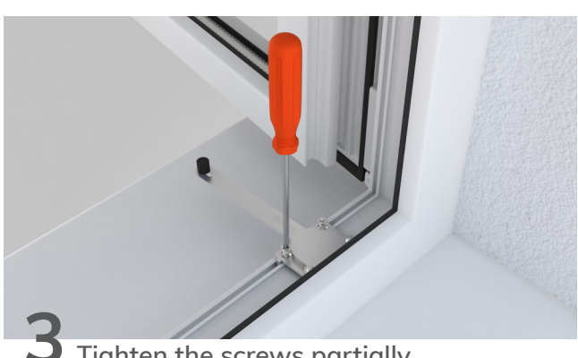
Tighten the screws partially.