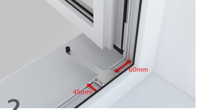
Insert the blockade base into the window frame about 60 mm from the inside edge of the window frame.